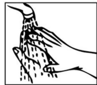
Donors should wash hands before donating specimens.