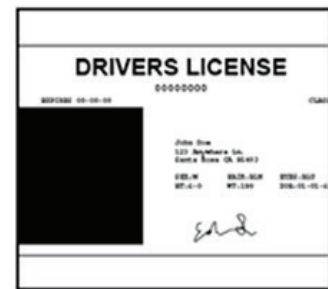
Verify the donors identity with a photo I.D.